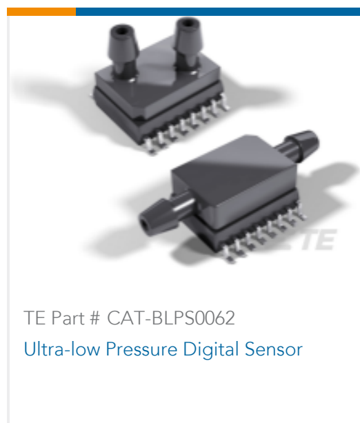
TE Part # CAT-BLPS0062 Ultra-low Pressure Digital Sensor