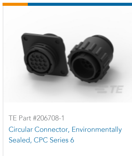
TE Part #206708-1 Circular Connector, Environmentally Sealed, CPC Series 6