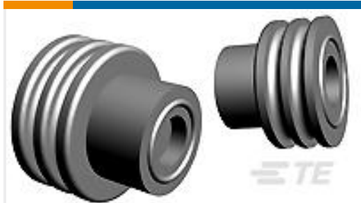
TE Part #1823111-1 SINGLE WIRE SEAL, FOR WIRE 2.5 SQMM, BN