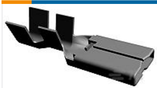
TE Part #1544227-1 CLIP 8 MM NG1-1 PO