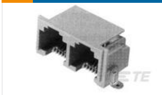
TE Part #5406903-1 MJ,RJ11,SMT,1X2,6/6,GRAY,22"RL