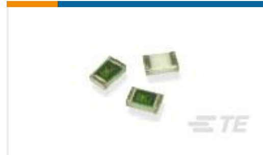
TE Part #1676234-2 RN 0805 1K4 0.1% 10PPM 1KRL