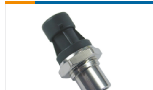
TE Part #U7139-030PA-5W0000 PRESS XDCR U7139-030PA-5W0000