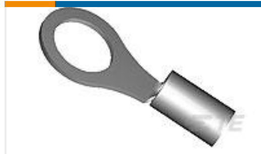
TE Part #324044 TERMINAL, T-N R 8 5/16