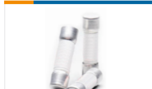
TE Part #1SNA167900R0200 EVD5