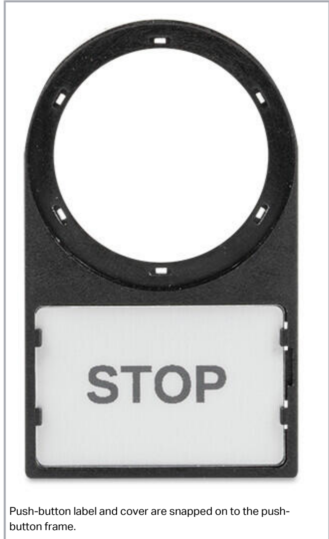
Push-button label and cover are snapped on to the push-button frame.