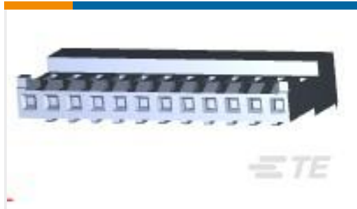
TE Part #4-643817-2 12P MTA156 CONN ASSY 18AWG LF