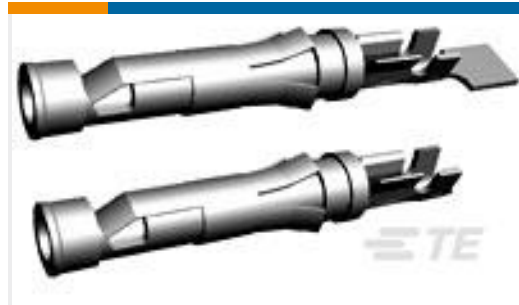
TE Part #1-66105-6 III+ SKT,24-20,TIN-LEAD,SMPACK