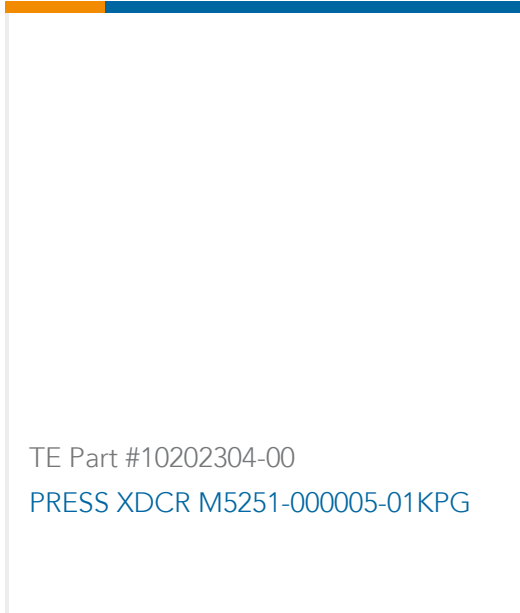
TE Part #10202304-00 PRESS XDCR M5251-000005-01KPG