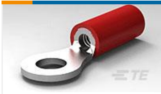
TE Part #170780-1 P.G RING UL.CSA(22-18)