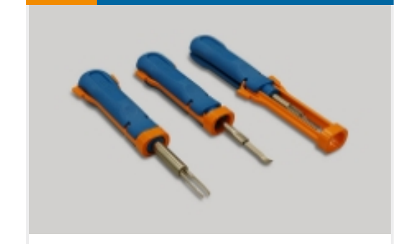
Insertion & Extraction Tools(18)