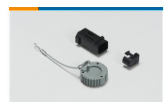
Automotive Connector Caps & Covers (10)