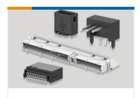
PCB Headers & Receptacles(77)