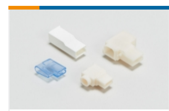
Crimp Terminal Housings(13)