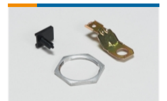
Other Automotive Connector Accessories(1)