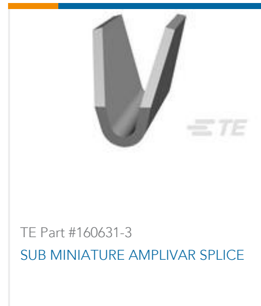
TE Part #160631-3 SUB MINIATURE AMPLIVAR SPLICE