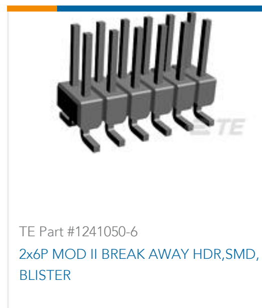
TE Part #1241050-6 2x6P MOD II BREAK AWAY HDR,SMD, BLISTER