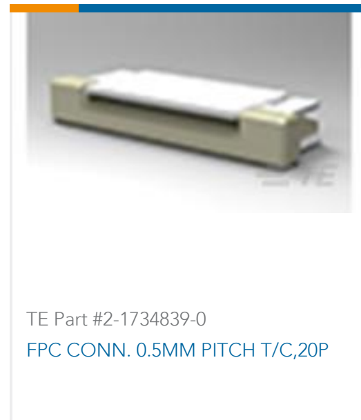
TE Part #2-1734839-0 FPC CONN. 0.5MM PITCH T/C,20P