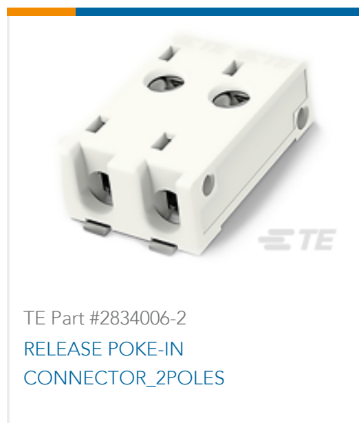
TE Part #2834006-2 RELEASE POKE-IN CONNECTOR_2POLES