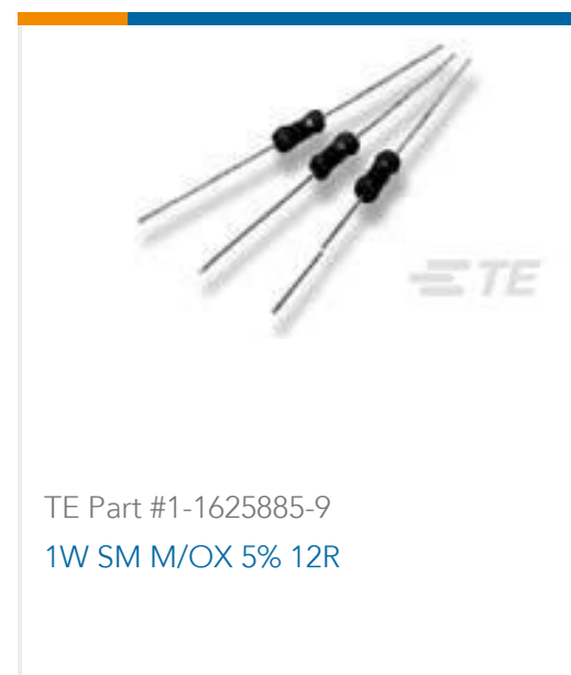
TE Part #1-1625885-9 1W SM M/OX 5% 12R