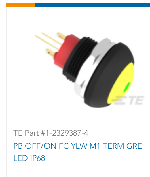
TE Part #1-2329387-4 PB OFF/ON FC YLW M1 TERM GRE LED IP68