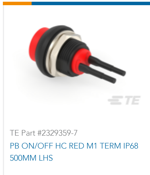
TE Part #2329359-7 PB ON/OFF HC RED M1 TERM IP68 500MM LHS