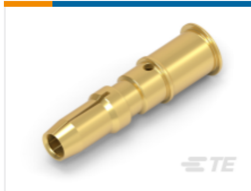
TE Part #60-0012-011-000 CONTACT SOCKET 2 MM