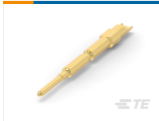
TE Part #61-0006-011-000 CONTACT PIN 1 MM