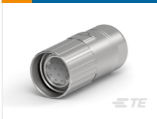
TE Part #ASA021N00620235000 623 PLUG