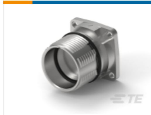
TE Part #AEA000N00000201000 623 RECEPTACLE, SPEEDTEC-READY