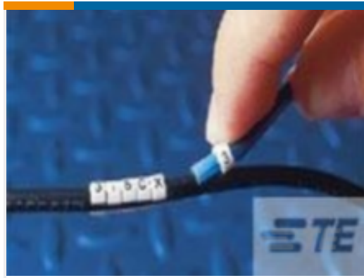
TE Part #1768041-1 STD01Y-8