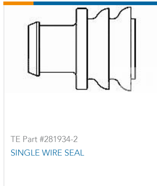
TE Part #281934-2 SINGLE WIRE SEAL