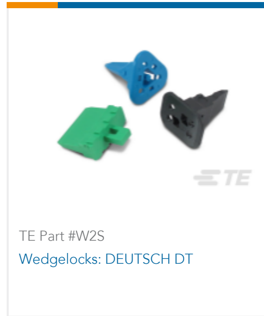
TE Part #W2S Wedgelocks: DEUTSCH DT