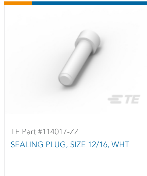
TE Part #114017-ZZ SEALING PLUG, SIZE 12/16, WHT