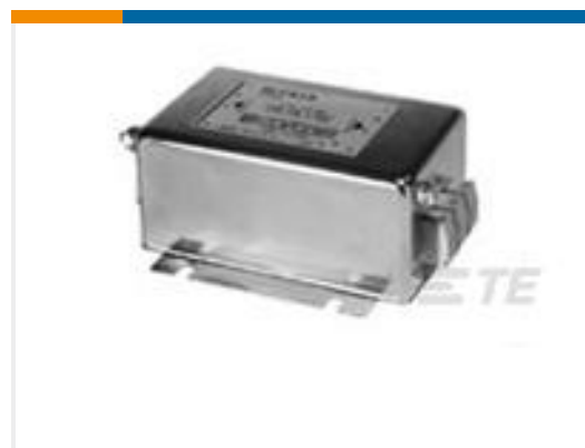
TE Part #6609070-5 36FCD10 J0=F7753