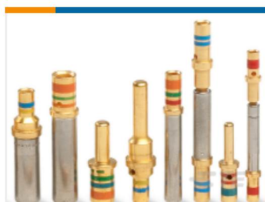
TE Part # 0007-008-100L CONT SOC ASSY