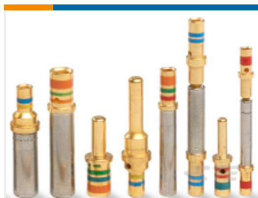
TE Part #4160-203-1631L CONT PIN