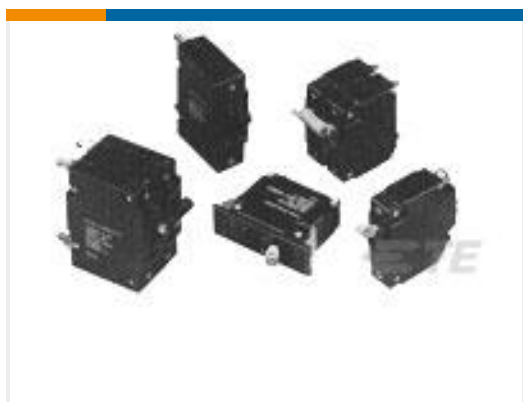
TE Part #3-1393254-0 W91-X112-5=M6/M7/M9/W6/W7