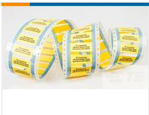
TE Part #478542-000 TMS-SCE-1K-3/32-2.0-S2-9