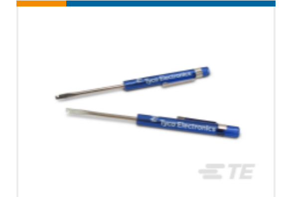
TE Part # CAT-AM7801-T618 Removal Tools — AMPSEAL 16