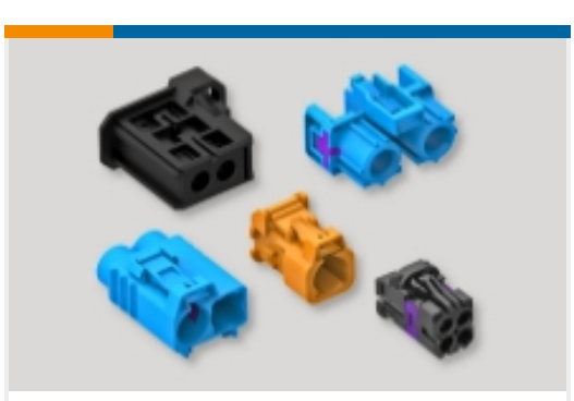
Data Connectivity Housings(3)