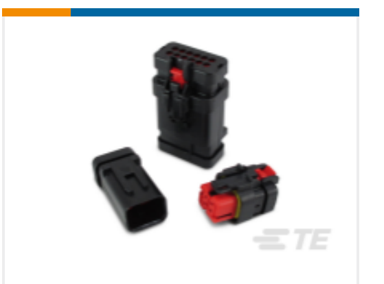
TE Part # CAT-AM7801-CH8172 AMPSEAL 16 Housings