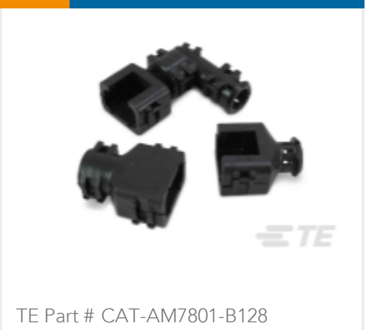
AMPSEAL 16 Connectors Backshell