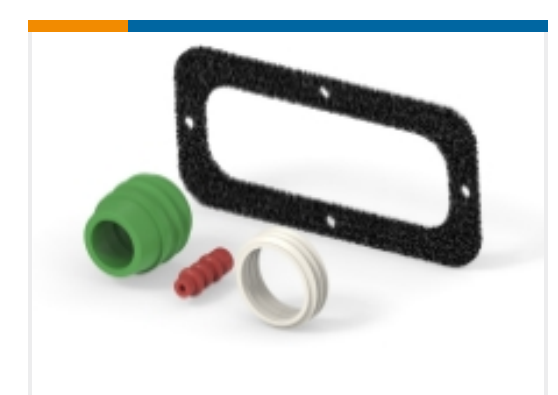
Connector Seals & Cavity Plugs(4)