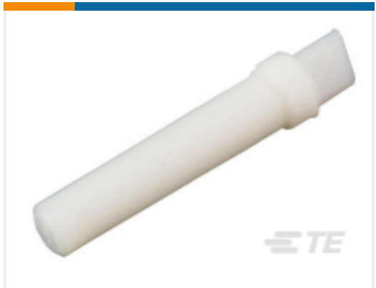
TE Part # 776364-1 SEALING PLUG, SZ 20 CAVITY