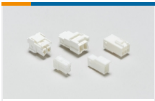
Rectangular Power Connectors(300)