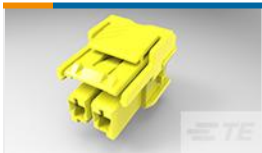
TE Part #4-1971773-2 PTL 1X2 PLUG HSG STD TEMP KEY D YEL