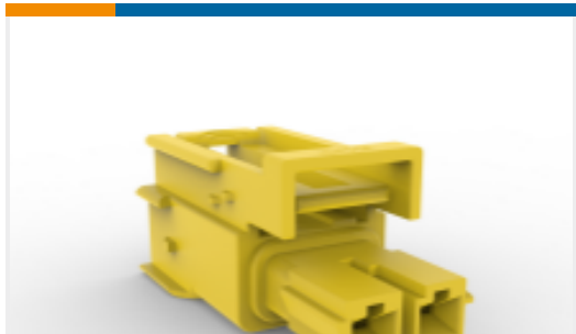
TE Part #7-2378159-2 Power Versa-Lock PLUG, 1X2 KEY G