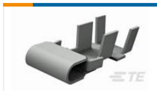
TE Part #1742539-3 CLUSTER BLOCK RECEPT,TPCuFeP