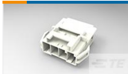
TE Part #1-1971772-4 PTL 1X4 CAP PANEL MT STD TEMP KEY A NAT