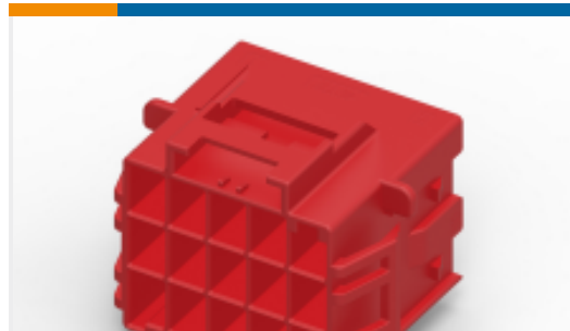
TE Part #7-1971772-3 POWER TRIPLE LOCK High Temperature Caps