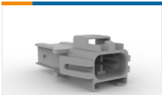
TE Part #2-2378158-2 Power Versa-Lock CAP, 1X2 KEY B