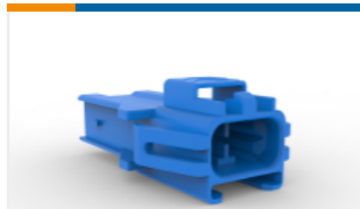
TE Part #8-2378158-2 Power Versa-Lock CAP, 1X2 KEY H