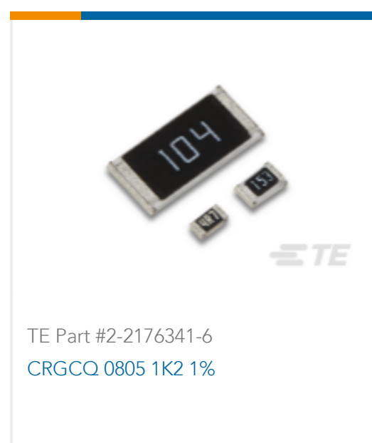
TE Part #2-2176341-6 CRGCQ 0805 1K2 1%