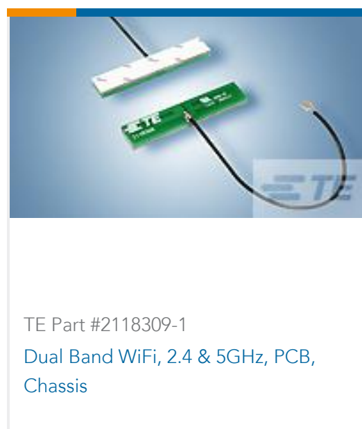
TE Part #2118309-1 Dual Band WiFi, 2.4 & 5GHz, PCB, Chassis