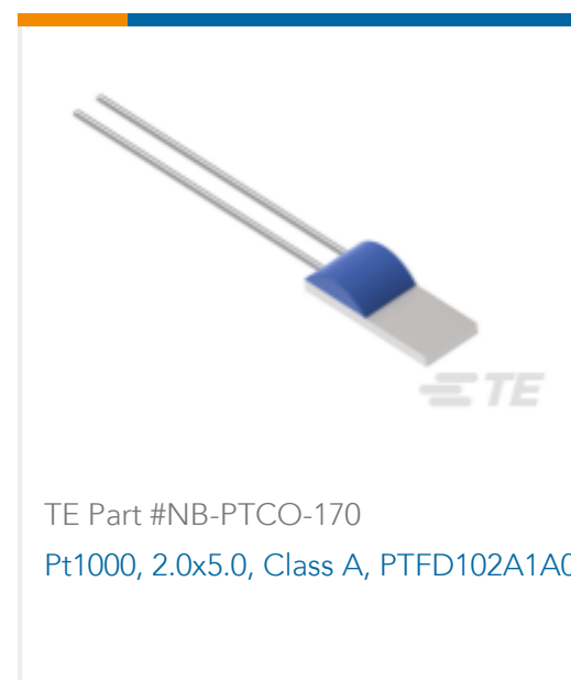
TE Part #NB-PTCO-170 Pt1000, 2.0x5.0, Class A, PTFD102A1A0