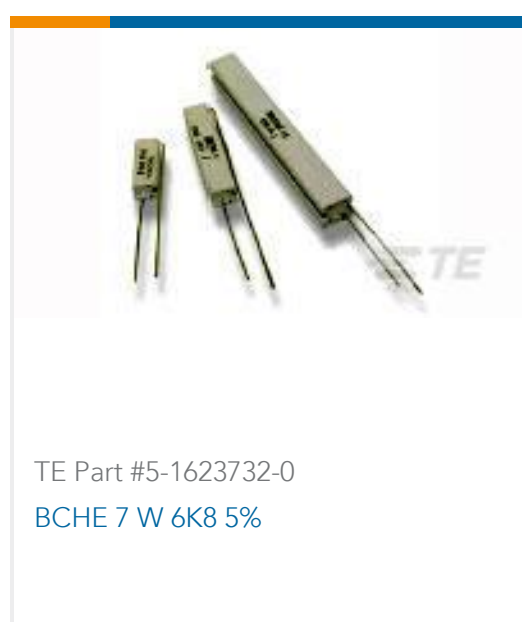
TE Part #5-1623732-0 BCHE 7 W 6K8 5%