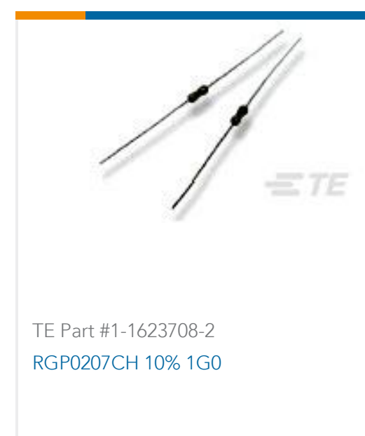
TE Part #1-1623708-2 RGP0207CH 10% 1G0