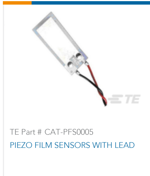
TE Part # CAT-PFS0005 PIEZO FILM SENSORS WITH LEAD