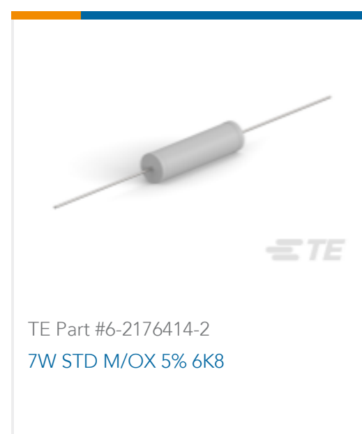
TE Part #6-2176414-2 7W STD M/OX 5% 6K8