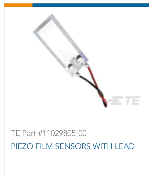
TE Part #11029805-00 PIEZO FILM SENSORS WITH LEAD