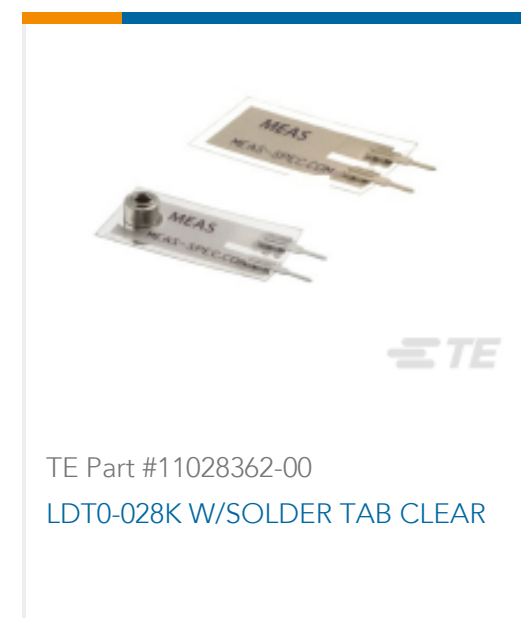
TE Part #11028362-00 LDT0-028K W/SOLDER TAB CLEAR