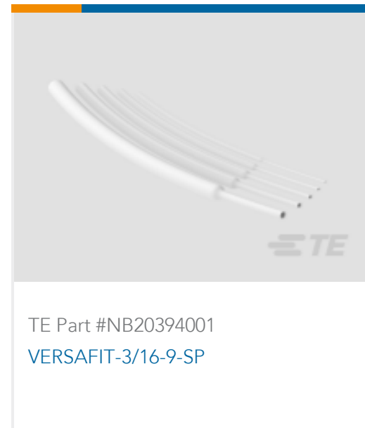
TE Part #NB20394001 VERSAFIT-3/16-9-SP