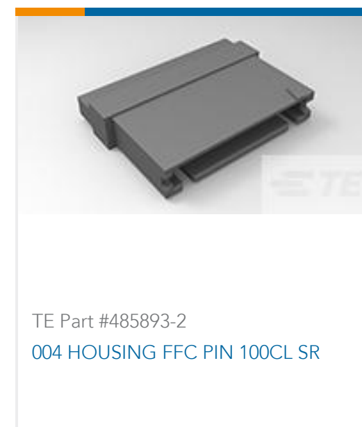
TE Part #485893-2 004 HOUSING FFC PIN 100CL SR