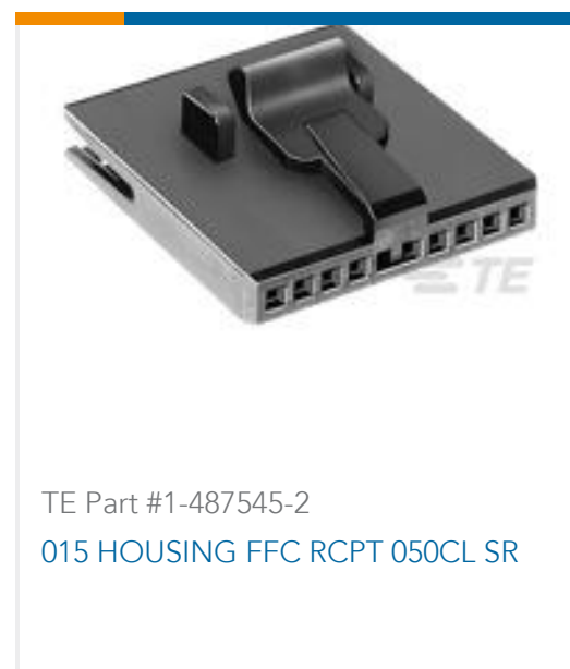
TE Part #1-487545-2 015 HOUSING FFC RCPT 050CL SR