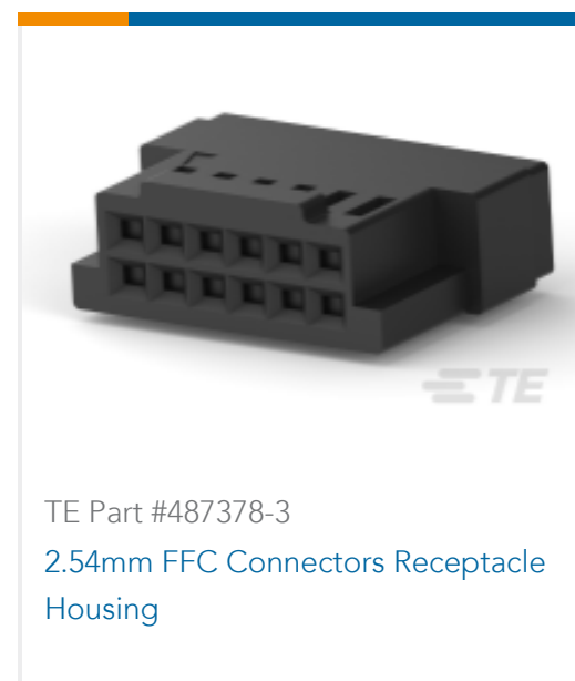
TE Part #487378-3 2.54mm FFC Connectors Receptacle Housing