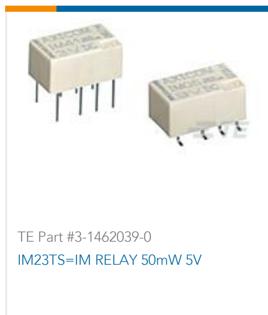
TE Part #3-1462039-0 IM23TS=IM RELAY 50mW 5V