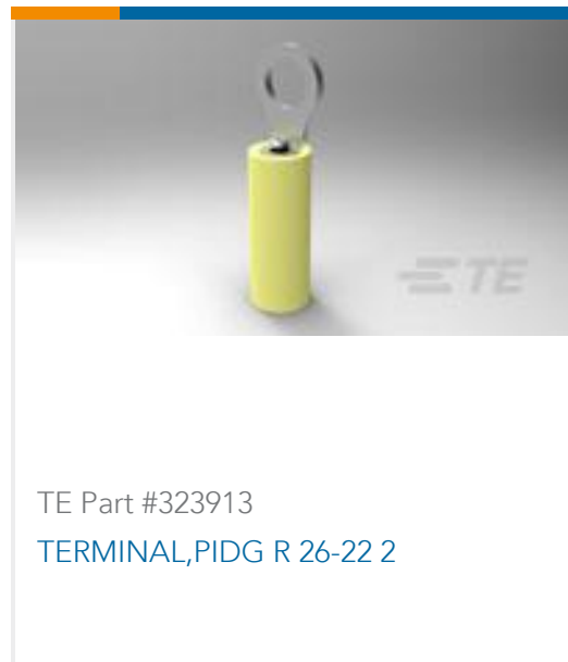
TE Part #323913 TERMINAL, PIDG R 26-22 2