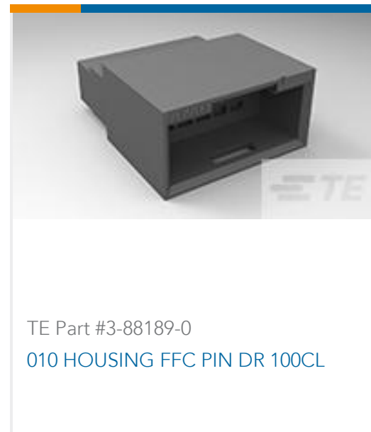
TE Part #3-88189-0 010 HOUSING FFC PIN DR 100CL