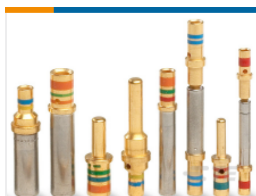
TE Part #0660-206-1631L CONT PIN