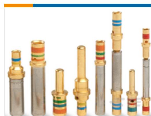
TE Part #38943-16L CONT SOC ASSY