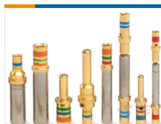
TE Part #2560-215-1631L CONT PIN