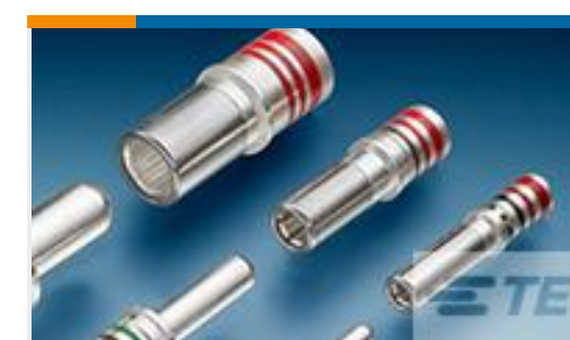
TE Part #0662-207-0482 CONT SOC ASSY