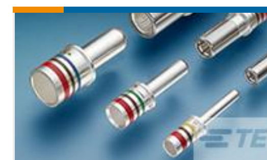
TE Part #0660-206-0082 CONT PIN