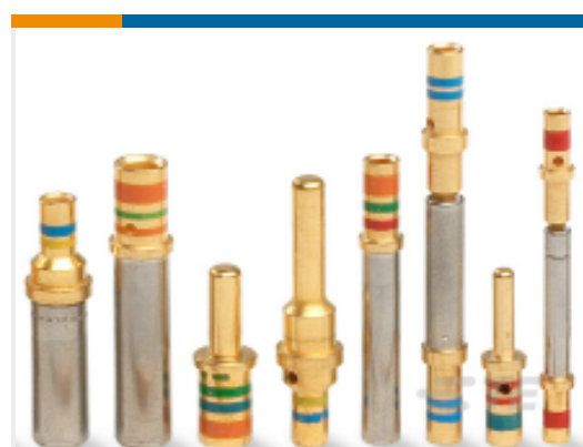
TE Part #0662-212-1631L CONT SOC ASSY