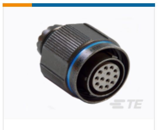
TE Part #YDTS26W15-35PNV001 PLUG ASSY