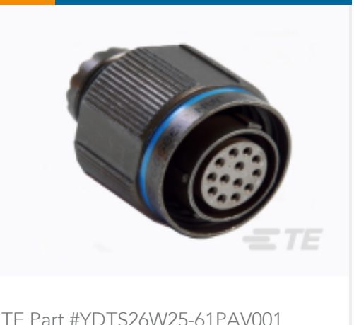
TE Part #YDTS26W25-61PAV001 PLUG ASSY