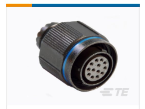
TE Part #YDTS26W17-35PNV001 PLUG ASSY