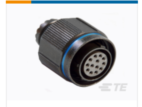
TE Part #YDTS26W25-35PNV001 PLUG ASSY