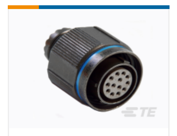
TE Part #YDTS26W15-18PNV001 PLUG ASSY