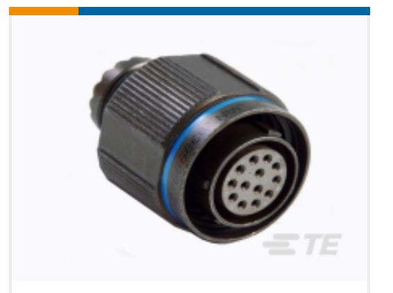
TE Part #YDTS26W17-26PAV001 PLUG ASSY