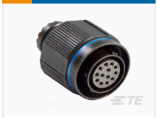
TE Part #YDTS26W23-55PNV001 PLUG ASSY