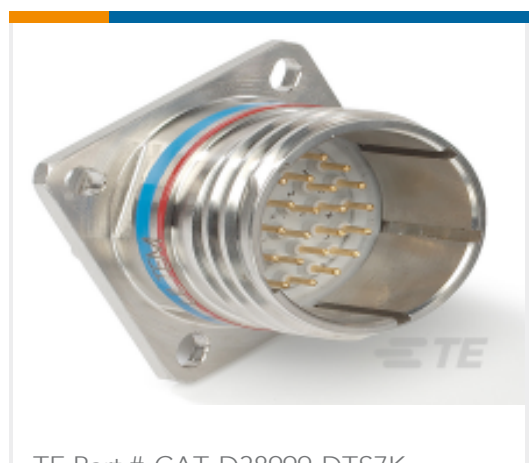
TE Part # CAT-D38999-DTS7K D38999: Square Flange, 25-61 insert