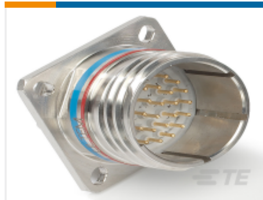
TE Part #YDTS20F13-35SNV001 RECP ASSY