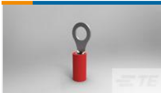
TE Part #320552 PIDG R 22-16 COMM 22-18 MIL 10