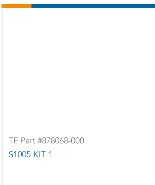
TE Part #878068-000 S1005-KIT-1