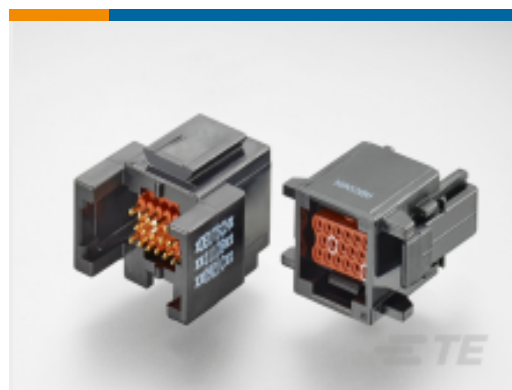
TE Part #ABC06G-20P-4048 IN-LINE PLUG