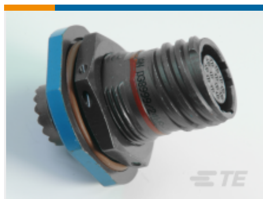
TE Part #YDTS24F09-98PNV001 RECP ASSY