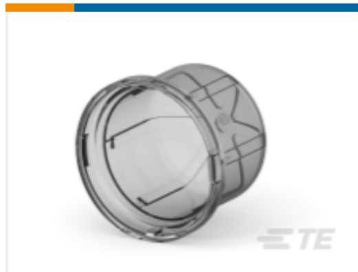
TE Part #2329013-2 LUMAWISE 40MM DIA DOME SMOKE GRAY TALL