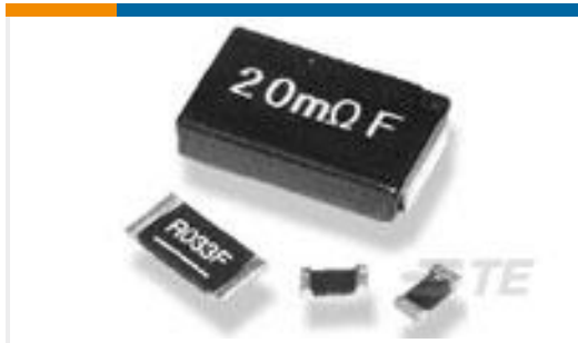
TE Part #2176157-1 TLM 2010 0.75W R01 5% 100PPM 4K RL