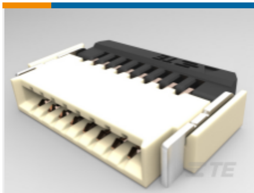
TE Part #1-2328702-0 10PIN 0.5MMP FPC CONN, BACK FLIP LOCK