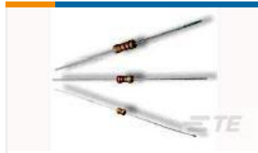
TE Part #6-1623930-6 CFR25 5% 2K2