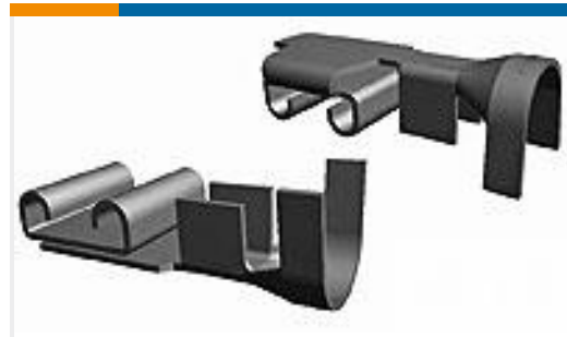
TE Part #62048-2 250 FASTON REC 18-14 AWG TPBR