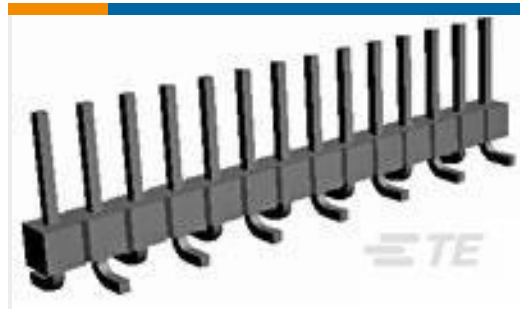
TE Part #1241150-4 4P MOD II BREAK AWAY HDR , SMD, BLISTER