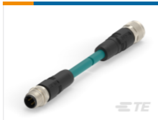
TE Part #TAD1453A201-001 M12 D-code 4pin Male to Female Cable Assembly, Cat5e TPE 24AWG Shielded