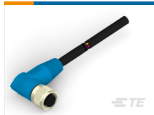
TE Part #T4161410008-002 RPC-M12-FR-8CON-PVC-1.0SH