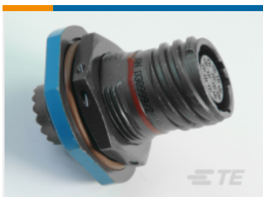
TE Part #YDTS24Z17-35PNV001 RECP ASSY