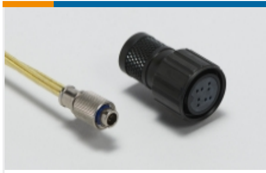
Standard Circular Connectors(9206)