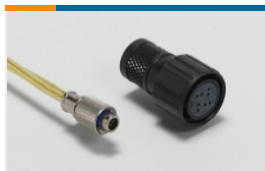
Standard Circular Connectors(2590)