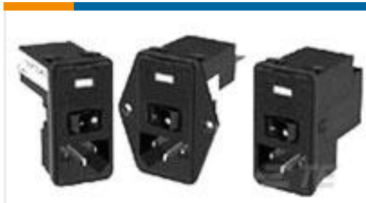
TE Part #6609105-9 PS0S0DBX0=C1177