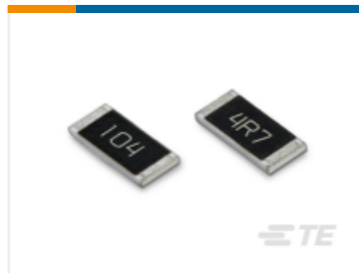
TE Part #4-2176455-1 CPF 0402 287K 0.1% 25ppm 1K RL