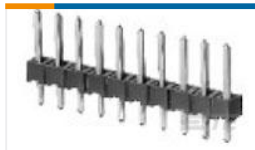
TE Part #9-146276-0 40 MODII HDR SRST B/A .100CL