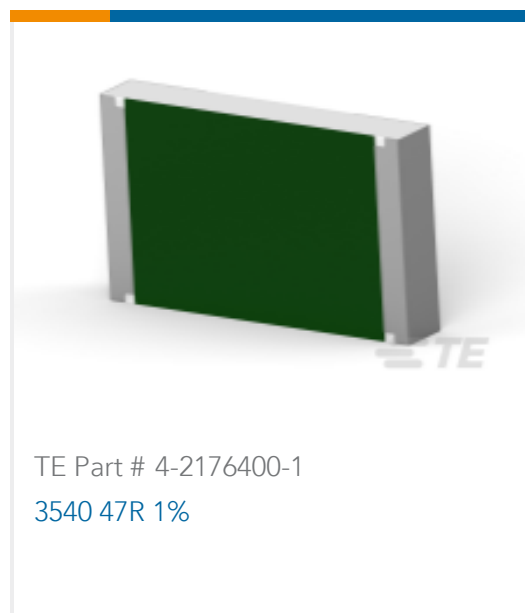
TE Part # 4-2176400-1 3540 47R 1%