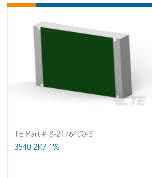
TE Part # 8-2176400-3 3540 2K7 1%