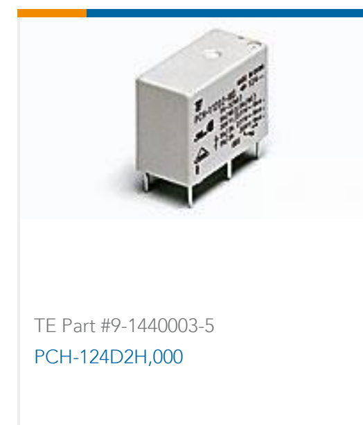
TE Part #9-1440003-5 PCH-124D2H,000