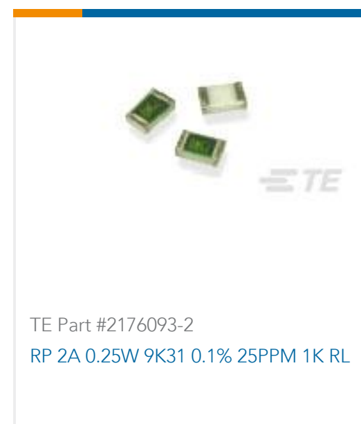
TE Part #2176093-2 RP 2A 0.25W 9K31 0.1% 25PPM 1K RL