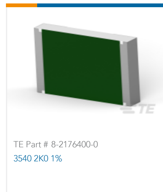
TE Part # 8-2176400-0 3540 2K0 1%