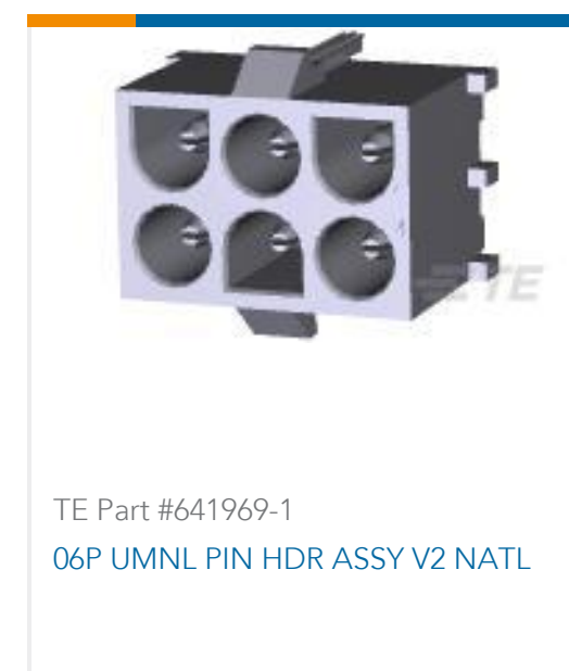
TE Part #641969-1 06P UMNL PIN HDR ASSY V2 NATL