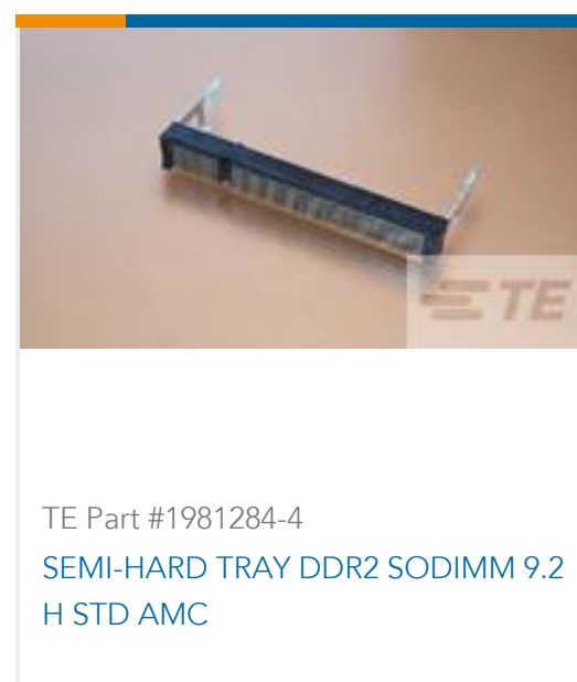
TE Part #1981284-4 SEMI-HARD TRAY DDR2 SODIMM 9.2 H STD AMC