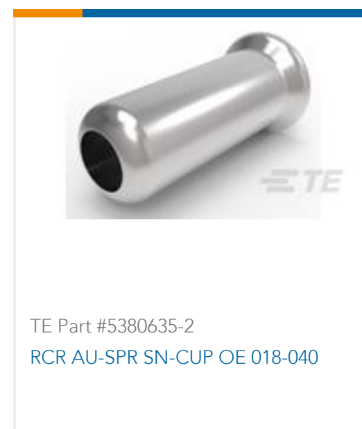
TE Part #5380635-2 RCR AU-SPR SN-CUP OE 018-040