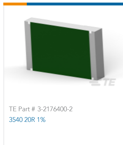
TE Part # 3-2176400-2 3540 20R 1%