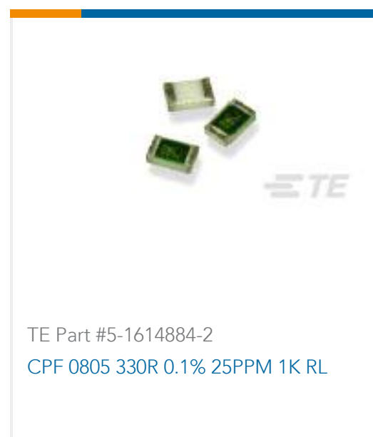
TE Part #5-1614884-2 CPF 0805 330R 0.1% 25PPM 1K RL