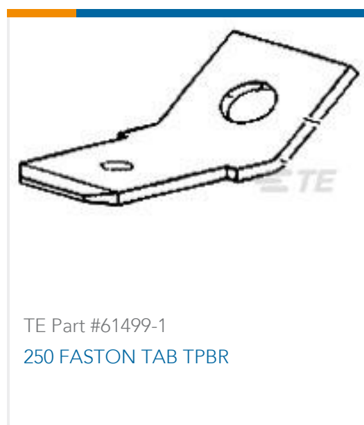
TE Part #61499-1 250 FASTON TAB TPBR