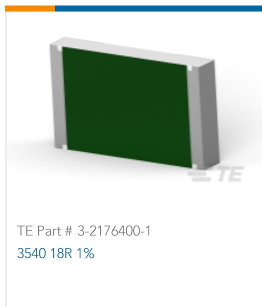
TE Part # 3-2176400-1 3540 18R 1%