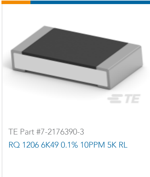
TE Part #7-2176390-3 RQ 1206 6K49 0.1% 10PPM 5K RL