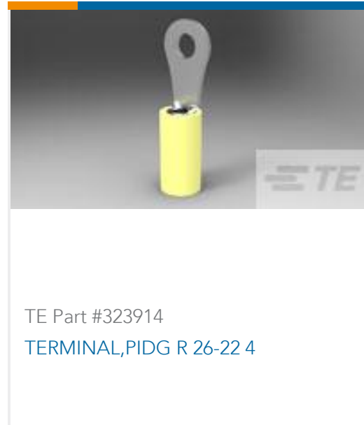
TE Part #323914 TERMINAL,PIDG R 26-22 4