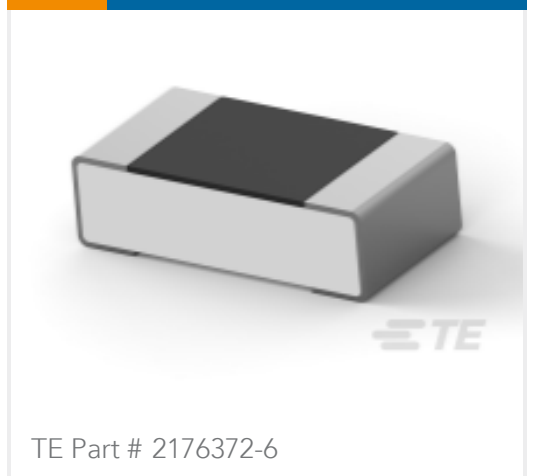
RQ 0603 56K2 0.1% 10PPM 5K RL