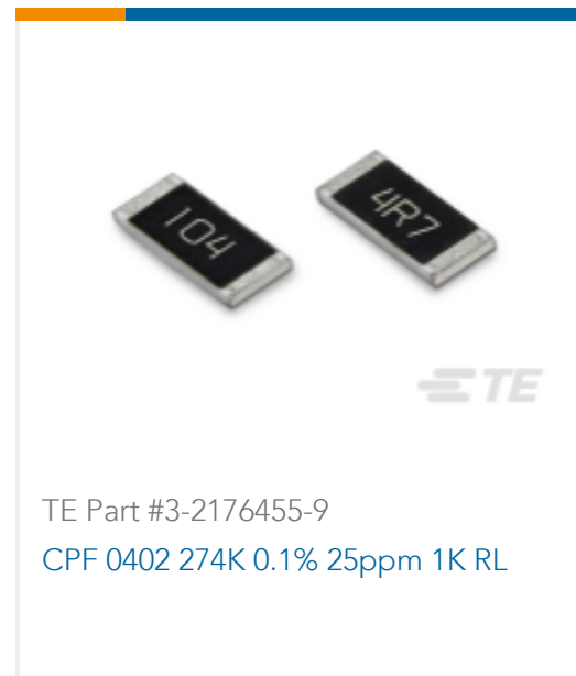
TE Part #3-2176455-9 CPF 0402 274K 0.1% 25ppm 1K RL