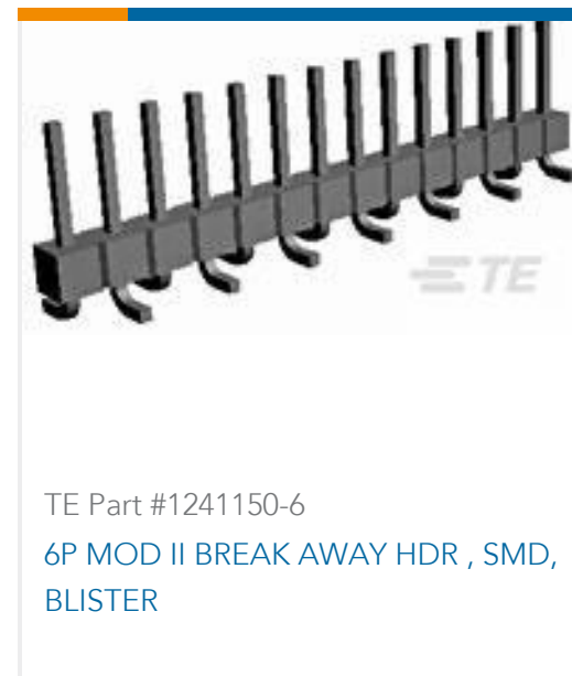
TE Part #1241150-6 6P MOD II BREAK AWAY HDR, SMD, BLISTER