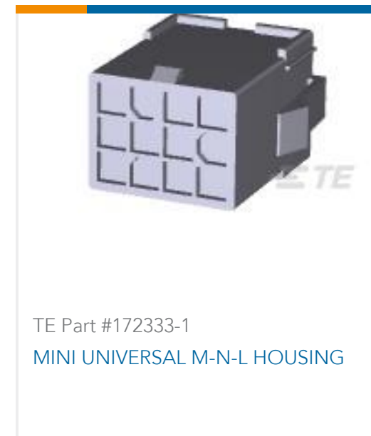
TE Part #172333-1 MINI UNIVERSAL M-N-L HOUSING BLISTER