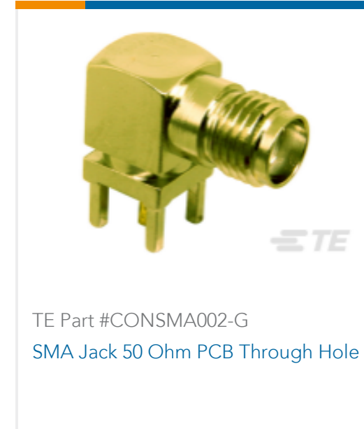
TE Part #CONSMA002-G SMA Jack 50 Ohm PCB Through Hole