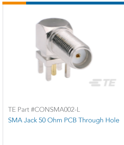
TE Part #CONSMA002-L SMA Jack 50 Ohm PCB Through Hole