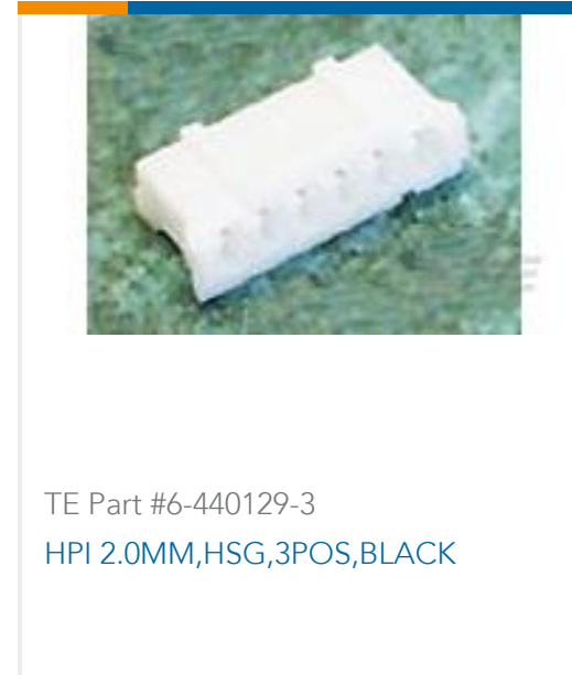
TE Part #6-440129-3 HPI 2.0MM,HSG,3POS,BLACK