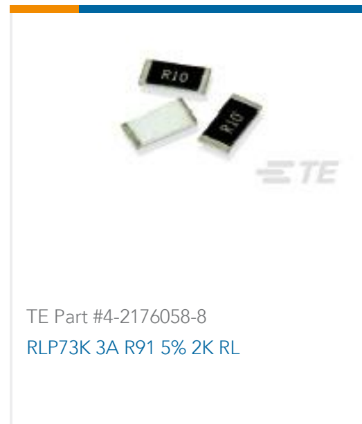
TE Part #4-2176058-8 RLP73K 3A R91 5% 2K RL