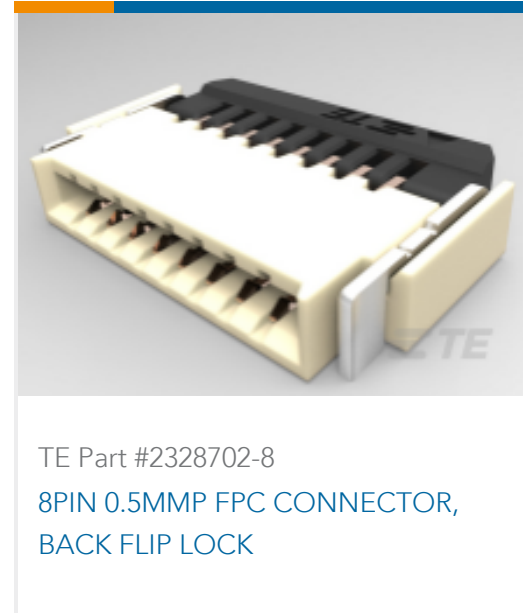
TE Part #2328702-8 8PIN 0.5MMP FPC CONNECTOR, BACK FLIP LOCK