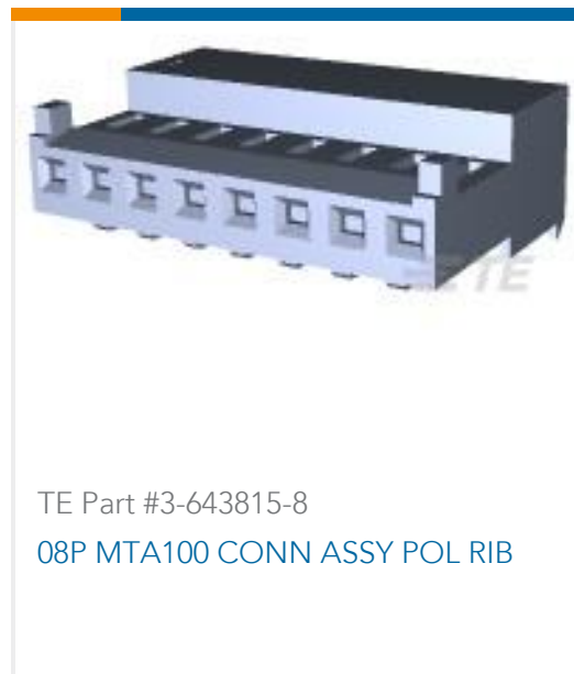
TE Part #3-643815-8 08P MTA100 CONN ASSY POL RIB