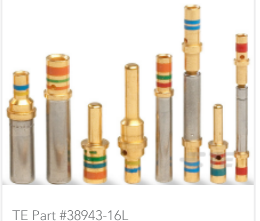
TE Part #38943-16L CONT SOC ASSY