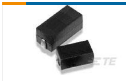
TE Part #7-1879021-7 SMW3 150R 5%