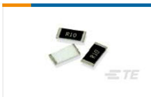
TE Part #2-2176055-6 RLP73K 2B R11 1% 1K RL