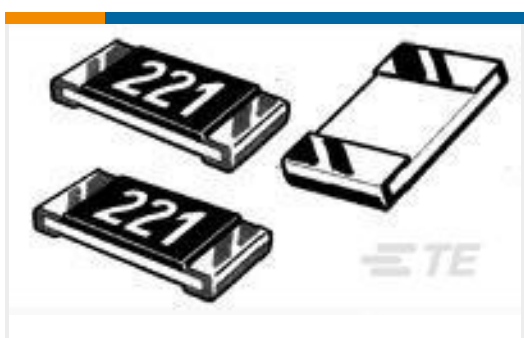
TE Part #3-2176230-8 3522 1K0 5% 3W