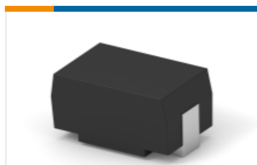
TE Part #6-1879021-1 SMD Power Resistor: 7 Watt, 200-2M Ohm