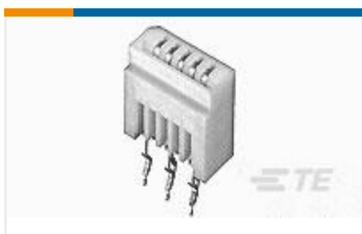
TE Part #3-84984-0 1mm FFC DIP V ASSY 30P TUBE