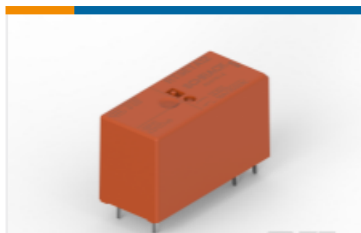
TE Part #8-1415898-6 RTSETA12