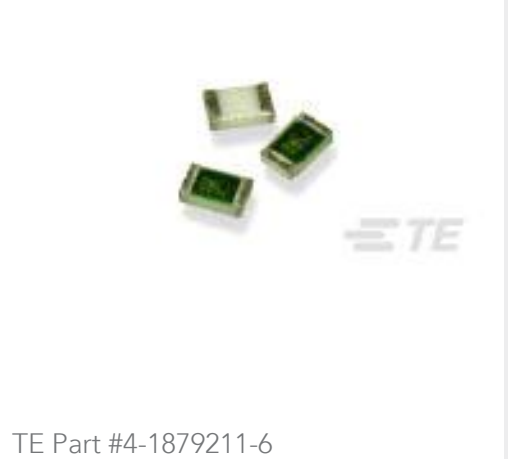
CPF 0402 4K99 0.1% 25PPM 5K RL