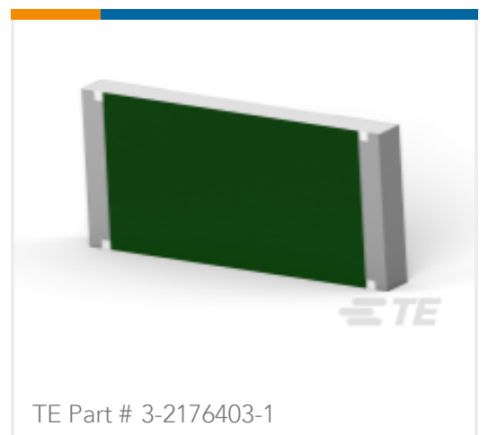
3550 18R 1%