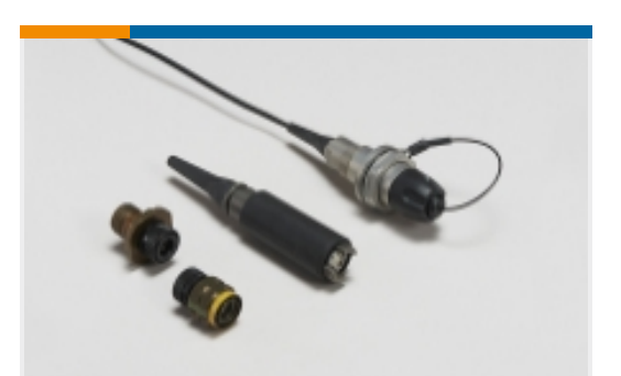
Expanded Beam Fiber Optics(9)