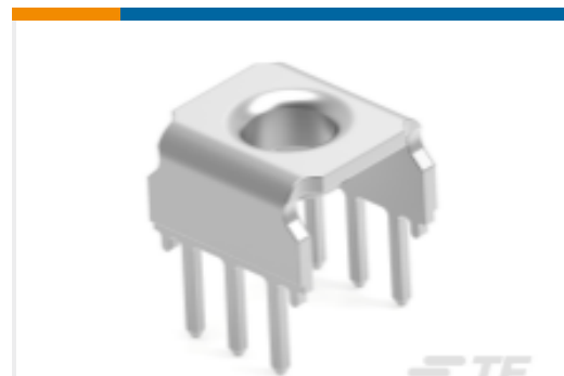
TE Part #214801-E EPSVA KS GDM3 TL 6 3,8 SN * STROMVERSORG