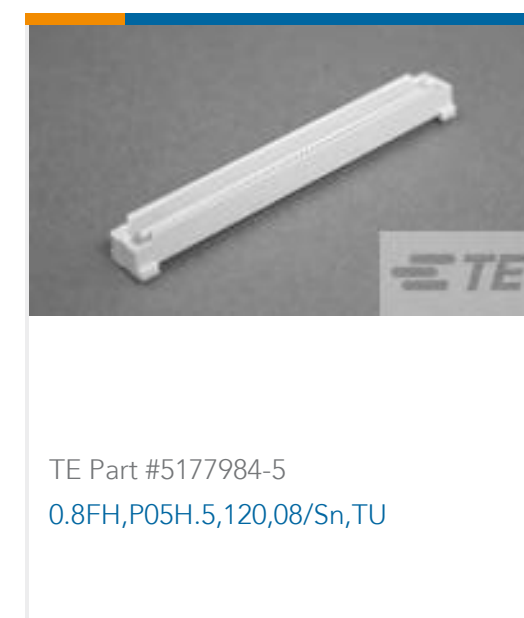
TE Part #5177984-5 0.8FH,P05H.5,120,08/Sn,TU