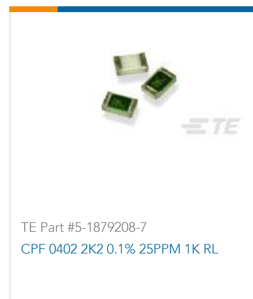
TE Part #5-1879208-7 CPF 0402 2K2 0.1% 25PPM 1K RL