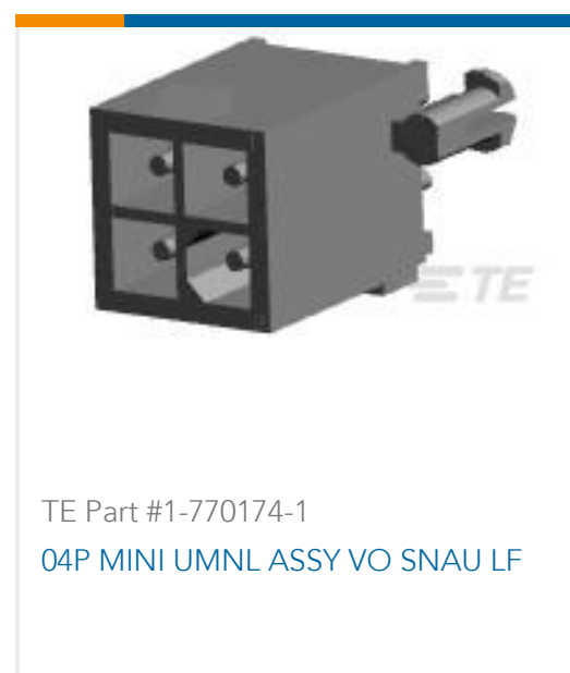
TE Part #1-770174-1 04P MINI UMNL ASSY VO SNAU LF