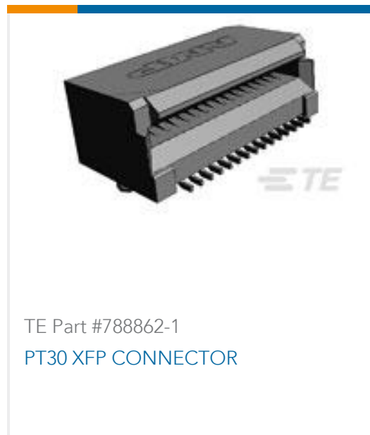
TE Part #788862-1 PT30 XFP CONNECTOR