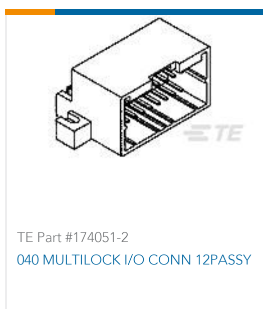
TE Part #174051-2 040 MULTILOCK I/O CONN 12PASSY