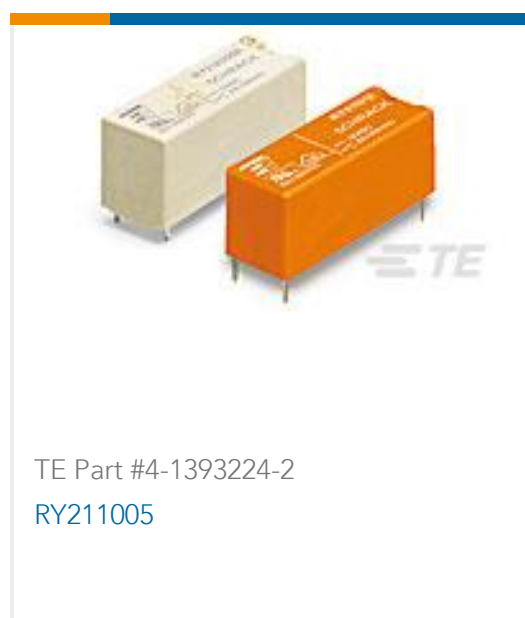
TE Part #4-1393224-2 RY211005