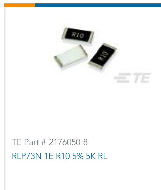
TE Part # 2176050-8 RLP73N 1E R10 5% 5K RL