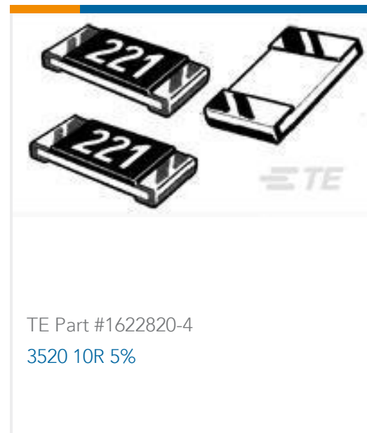
TE Part #1622820-4 3520 10R 5%