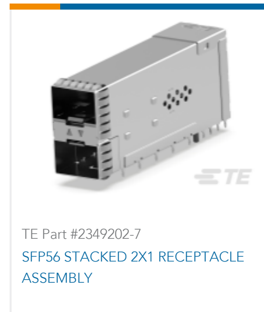
TE Part #2349202-7 SFP56 STACKED 2X1 RECEPTACLE ASSEMBLY