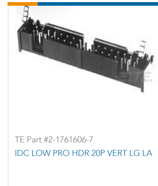
TE Part #2-1761606-7 IDC LOW PRO HDR 20P VERT LG LA