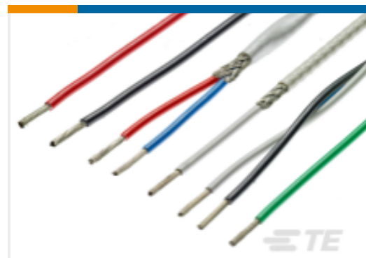
TE Part #F118933001 44A0111-18-0(B01)