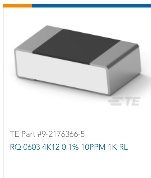
TE Part #9-2176366-5 RQ 0603 4K12 0.1% 10PPM 1K RL