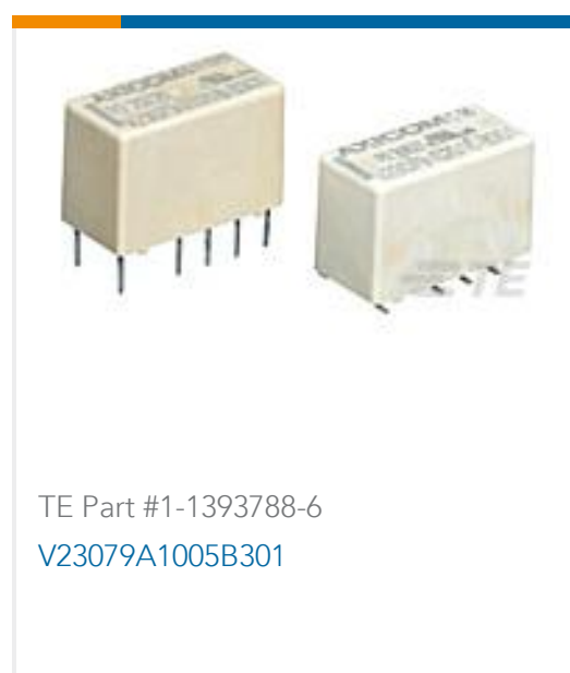
TE Part #1-1393788-6 V23079A1005B301