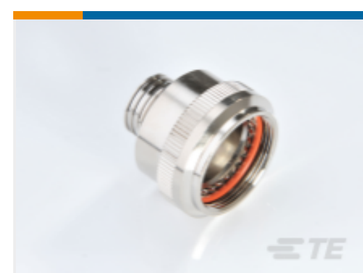
TE Part # 70H1-17-10-1-B 70H1-17-10-1-B