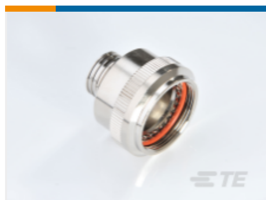
TE Part # 70H1-17-04-1-B 70H1-17-04-1-B