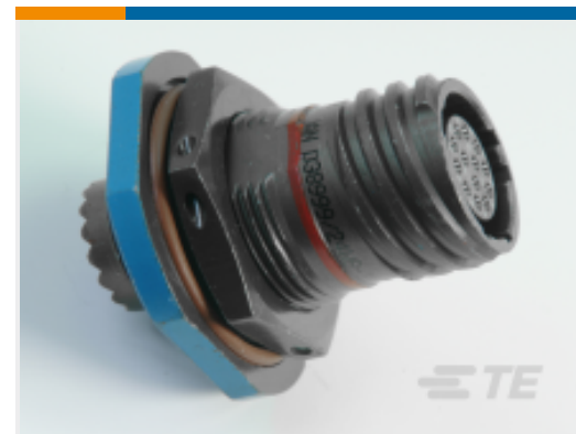
TE Part # CAT-D38999-DTS15L Jam Nut: D38999, 17-35 Insert