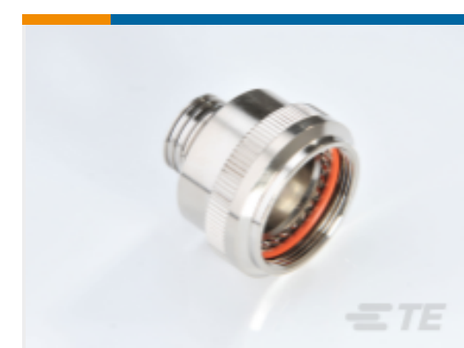
TE Part # EK3748-000 70H1-17-12-1-B