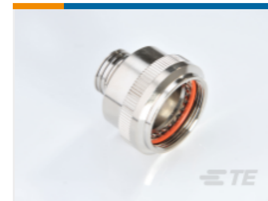
TE Part # EK5592-000 70H1-17-03-1-B