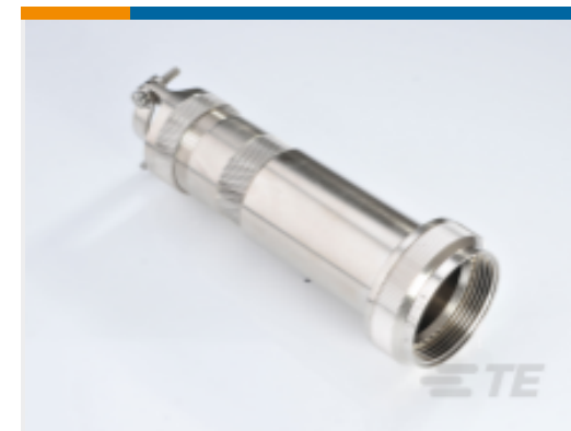
TE Part # AAA5290-00 39H1-17-06-1-B-CC-L3