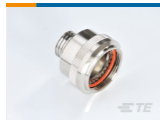
TE Part # 70H1-17-06-1-B 70H1-17-06-1-B