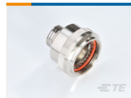
TE Part # 70H1-17-07-1-B 70H1-17-07-1-B