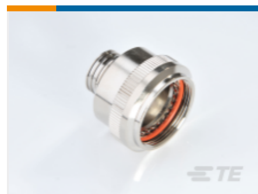
TE Part # 70H1-17-05-1-B 70H1-17-05-1-B