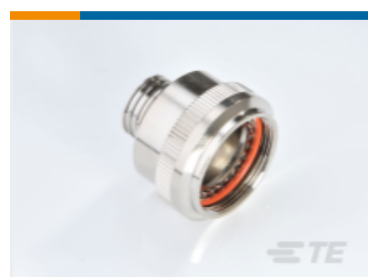
TE Part # 70H1-17-09-1-B 70H1-17-09-1-B