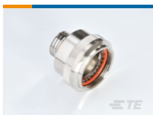
TE Part # 70H1-17-08-1-B 70H1-17-08-1-B