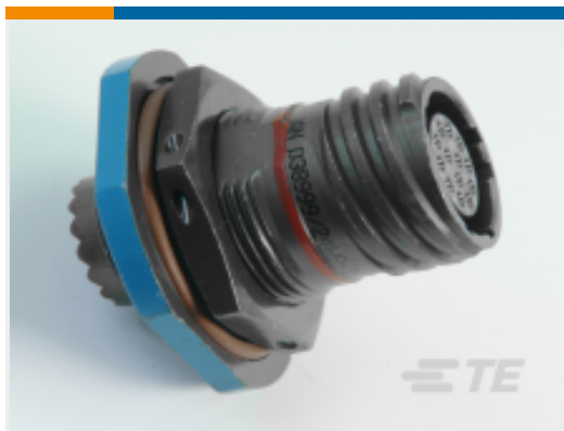
TE Part # CAT-D38999-DTS15P Jam Nut: D38999, 19-35 Insert