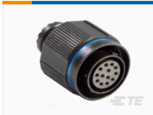
TE Part #YDTS26W11-98SNV001 PLUG ASSY