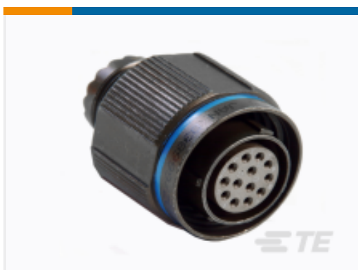
TE Part #YDTS26W15-19SNV001 PLUG ASSY