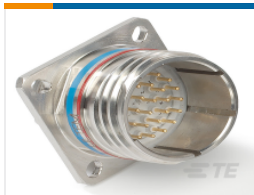
TE Part # CAT-D38999-DTS6X D38999: Square Flange, 19-35 insert