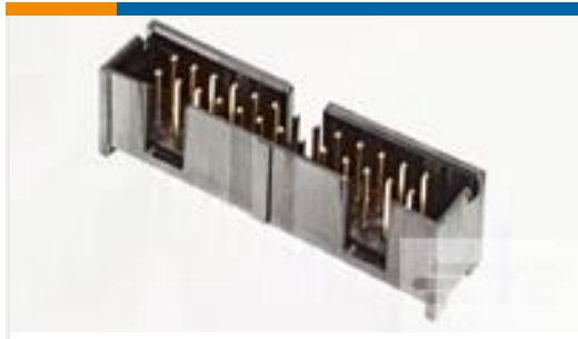
TE Part #103309-6 026 LOPRO HDR SP 30DP