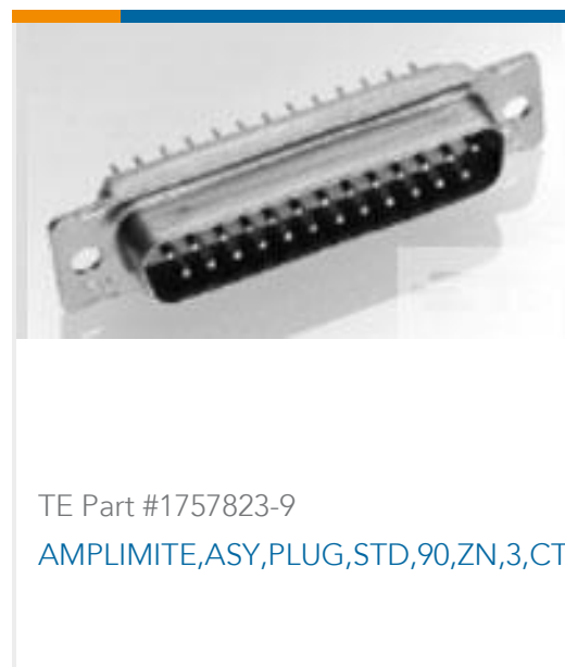
TE Part #1757823-9 AMPLIMITE,ASY,PLUG,STD,90,ZN,3,CT