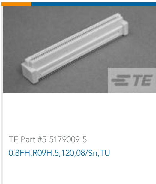
TE Part #5-5179009-5 0.8FH,R09H.5,120,08/Sn,TU