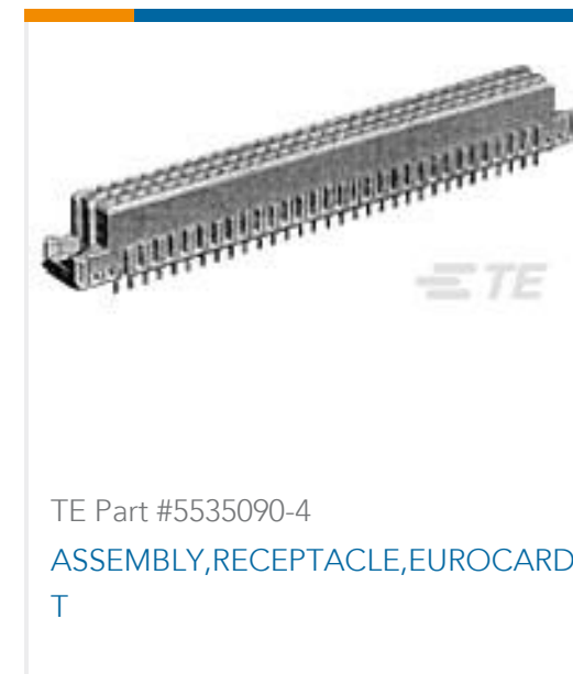
TE Part #5535090-4 ASSEMBLY,RECEPTACLE,EUROCARD, T