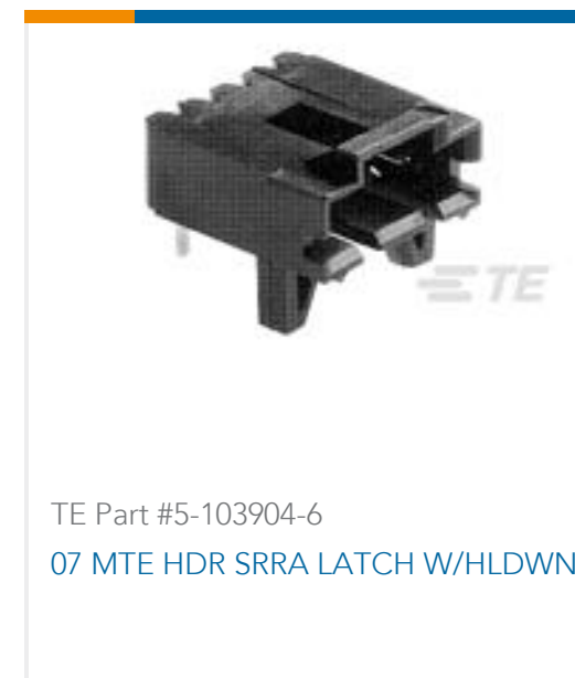
TE Part #5-103904-6 07 MTE HDR SRRA LATCH W/HLDWN