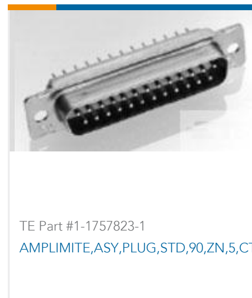
TE Part #1-1757823-1 AMPLIMITE,ASY,PLUG,STD,90,ZN,5,CT