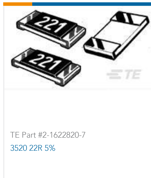
TE Part #2-1622820-7 3520 22R 5%