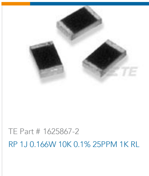
TE Part # 1625867-2 RP 1J 0.166W 10K 0.1% 25PPM 1K RL