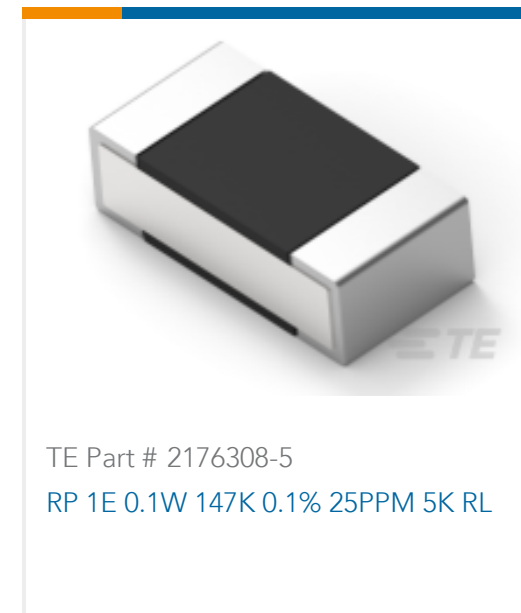
TE Part # 2176308-5 RP 1E 0.1W 147K 0.1% 25PPM 5K RL