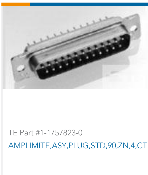
TE Part #1-1757823-0 AMPLIMITE,ASY,PLUG,STD,90,ZN,4,CT