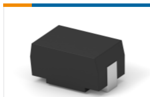
TE Part #3-1879011-9 SMD Power Resistor: 7 Watt, 200-2M Ohm