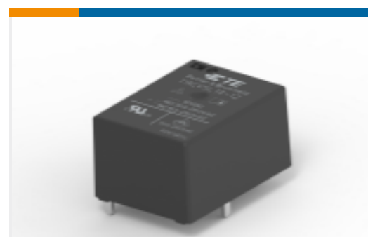
TE Part #1558665-7 T9GS5L14-24