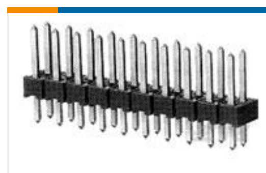
TE Part #826925-3 03P MODU 2 PIN HDR.