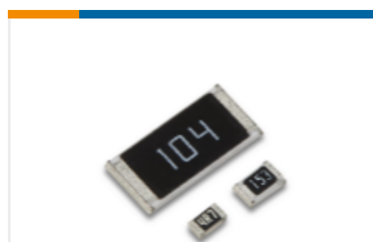
TE Part #5-2176349-3 CRGCQ 2512 220K 1%