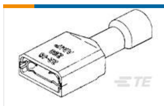
TE Part #3-520404-2 ULTRA-FAST 187 ASY REC 16-14 AWG TPBR