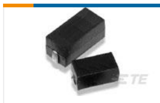
TE Part #2-1879021-9 SMW3 1R5 5%