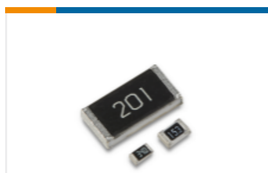
TE Part #2176329-3 CRGP 1210 15R 1%