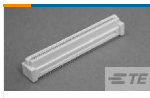
TE Part #5-5179009-4 0.8FH,R09H.5,100,08/Sn,TU