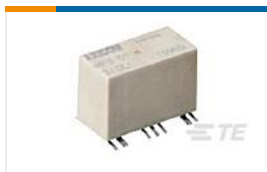
TE Part #1462050-4 HF306=75OHM140MW12V MONO