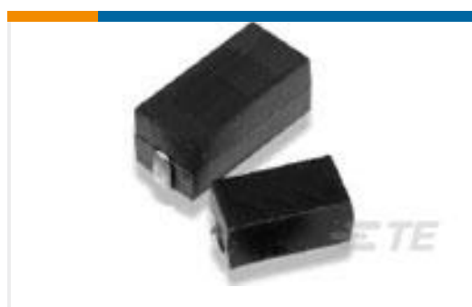
TE Part #6-1879021-1 SMW3 33R 5%