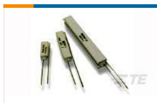
TE Part #1-1623730-4 BCHE 4 W 330R 5%