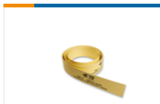
TE Part #EL7645-000 TMS-CT-50M-3/16-OUT-4