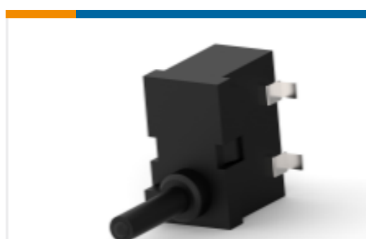
TE Part #2331398-2 DET SW6.5X3.9X6.0 GW VERT. NO AG RL