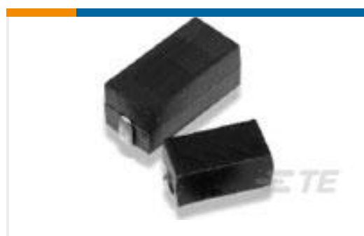
TE Part #3-1879021-7 SMW3 3R3 5%