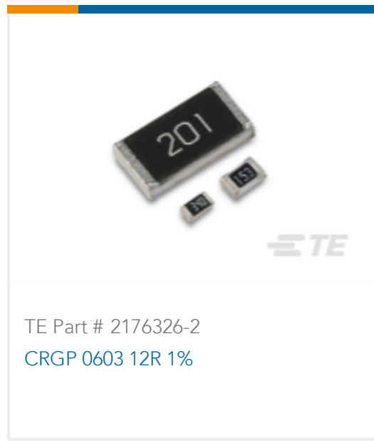
TE Part # 2176326-2 CRGP 0603 12R 1%