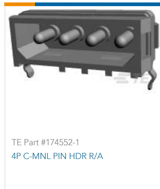
TE Part #174552-1 4P C-MNL PIN HDR R/A