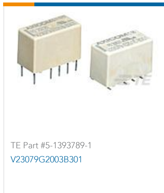
TE Part #5-1393789-1 V23079G2003B301