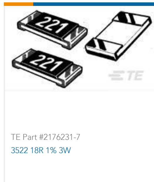
TE Part #2176231-7 3522 18R 1% 3W