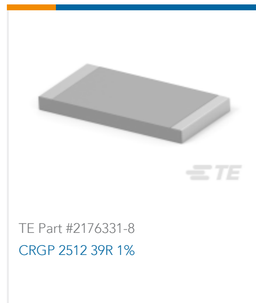
TE Part #2176331-8 CRGP 2512 39R 1%