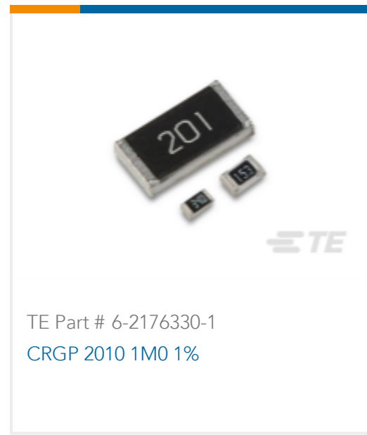
TE Part # 6-2176330-1 CRGP 2010 1M0 1%