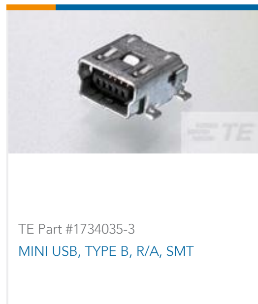
TE Part #1734035-3 MINI USB, TYPE B, R/A, SMT