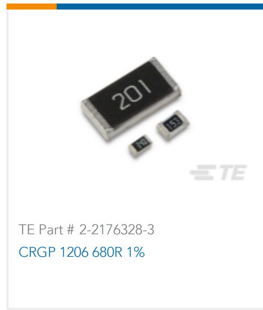
TE Part # 2-2176328-3 CRGP 1206 680R 1%