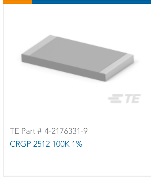
TE Part # 4-2176331-9 CRGP 2512 100K 1%