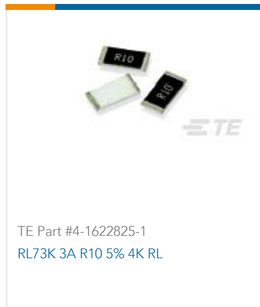
TE Part #4-1622825-1 RL73K 3A R10 5% 4K RL