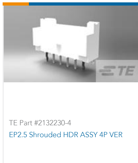
TE Part #2132230-4 EP2.5 Shrouded HDR ASSY 4P VER