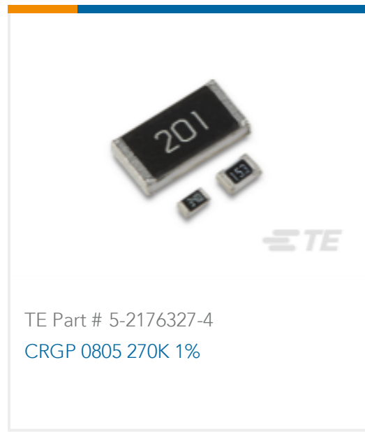
TE Part # 5-2176327-4 CRGP 0805 270K 1%