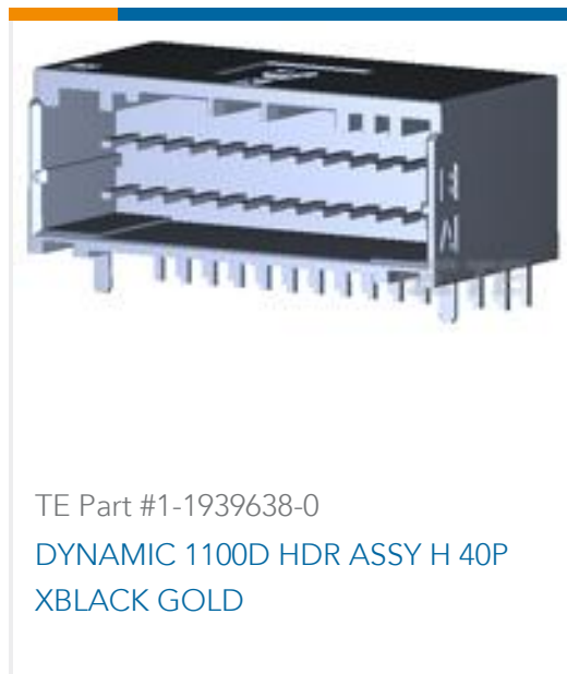
TE Part #1-1939638-0 DYNAMIC 1100D HDR ASSY H 40P XBLACK GOLD