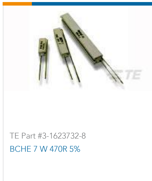
TE Part #3-1623732-8 BCHE 7 W 470R 5%