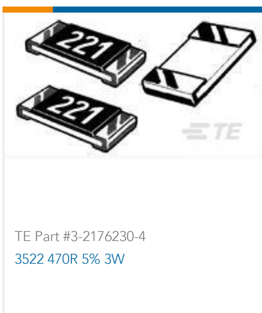
TE Part #3-2176230-4 3522 470R 5% 3W