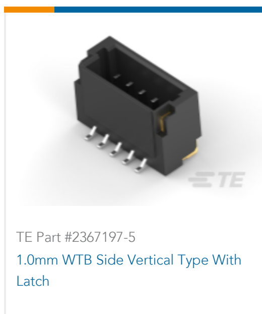
TE Part #2367197-5 1.0mm WTB Side Vertical Type With Latch