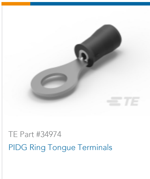
TE Part #34974 PIDG Ring Tongue Terminals