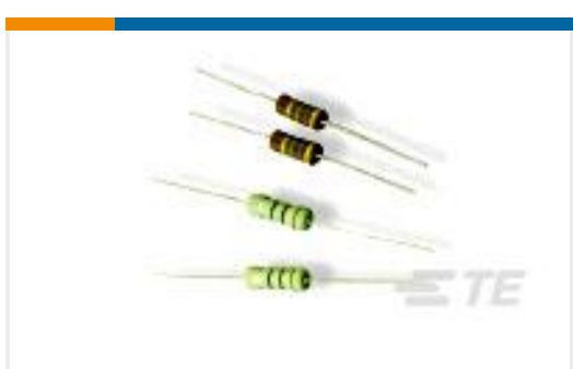
TE Part #2-1623720-5 CCR2 18R 10%