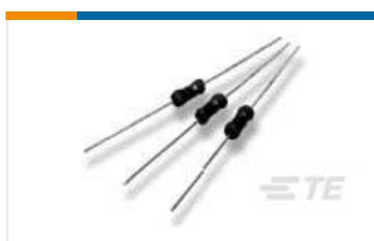
TE Part #2-1625885-7 1W SM M/OX 5% 180R