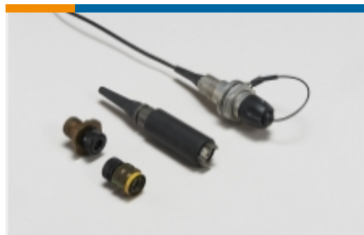
Expanded Beam Fiber Optics(9)