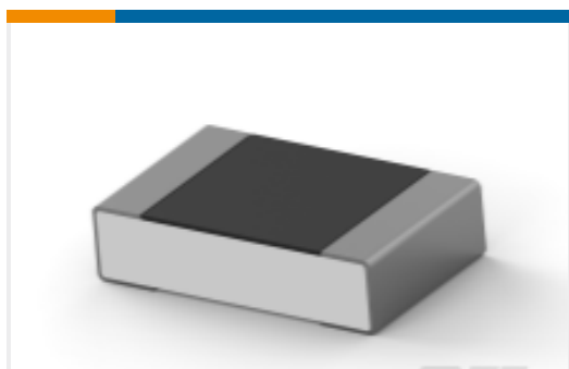
TE Part #9-2176374-4 RQ 0805 1K0 0.1% 10PPM 1K RL