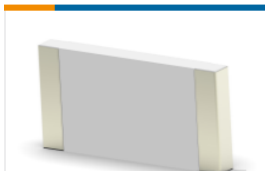
TE Part #2-2176251-5 CRGS2010 5% 100R