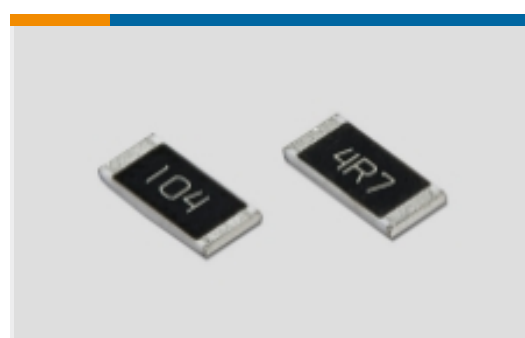
Surface Mount Resistors(554)