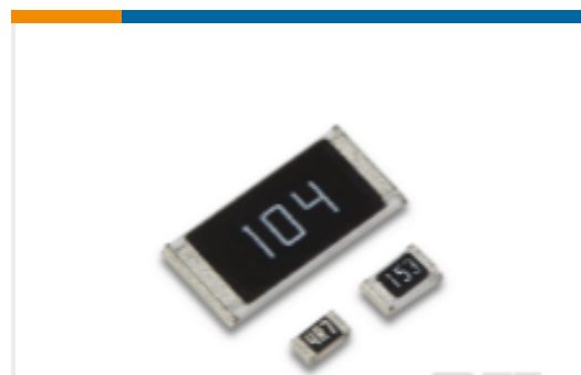
TE Part #1-2176339-9 CRGCQ 0603 330R 1%