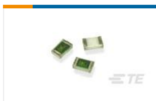
TE Part #1676228-2 RN 0805 1K27 0.1% 10PPM 1KRL