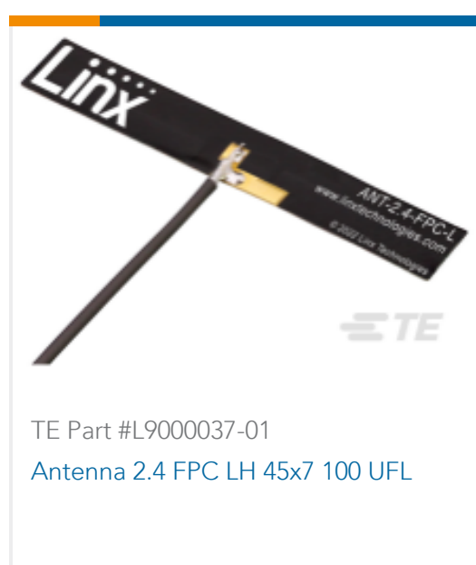
TE Part #L9000037-01 Antenna 2.4 FPC LH 45x7 100 UFL