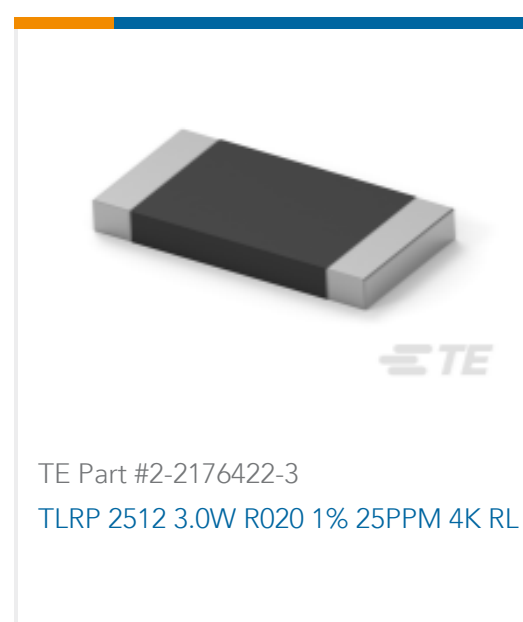
TE Part #2-2176422-3 TLRP 2512 3.0W R020 1% 25PPM 4K RL