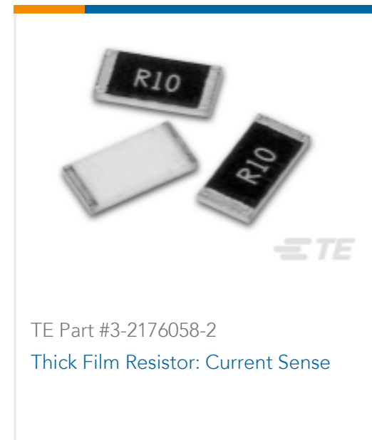
TE Part #3-2176058-2 Thick Film Resistor: Current Sense