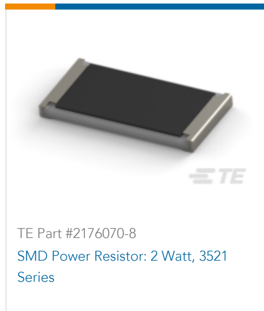
TE Part #2176070-8 SMD Power Resistor: 2 Watt, 3521 Series