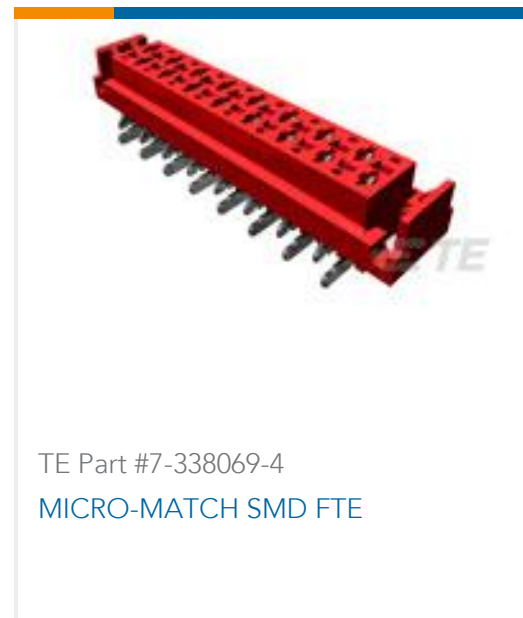
TE Part #7-338069-4 MICRO-MATCH SMD FTE