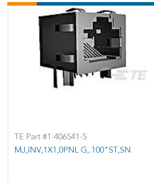
TE Part #1-406541-5 MJ,INV,1X1,0PNL G.,100"ST,SN