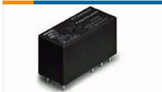
TE Part #2-1419108-4 RTB14005F