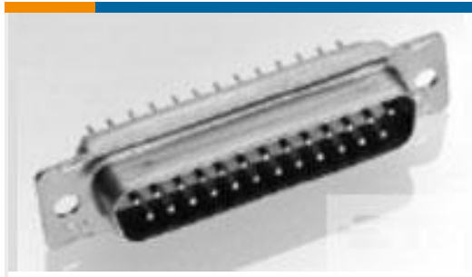
TE Part #1757828-2 AMPLIMITE,RCPT ASY,POSTD,109,ZN, 2