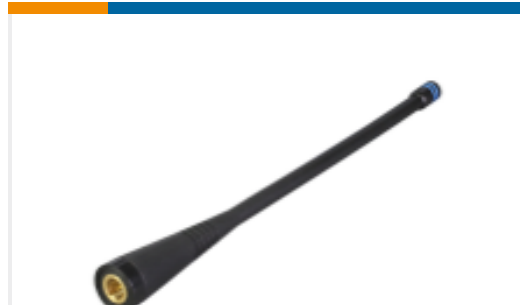
TE Part #ANT-418-CW-QW-SMA Antenna 1/4 Wave Whip 418MHz SMA