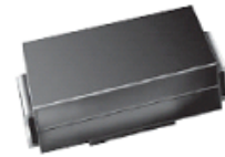
SMA ( DO - 214AC )