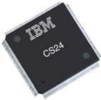
Figure 1: IBM's single-chip digital audio/video decoders integrate advanced features for high-performance solutions.